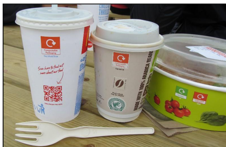
Figure 2 Examples of compostable food and drink packaging and cutlery

In contrast, LOCOG has been able to dig deeper into these figures as it had exclusive use of SITA UK's MRF in Barking for 78 days and a contractual requirement to track all waste to its end processes – which many businesses in the UK do not do. This tracking showed the true re-use, recycling and composting rate was 62%.