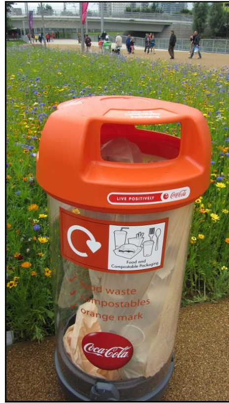
Figure 1 Signage near BoH bins in catering area (left) and sponsor branding on FoH compostable bins (right)

This was addressed during transition between the Olympic and Paralympic Games by putting stickers instructing 'No plastic' on the compostables bins and adding the same instruction to signage near the appropriate bins. In addition, during the transition period, in the Back of House (BoH) catering areas posters above the bins were made clearer in terms of which waste types should go into which bin.